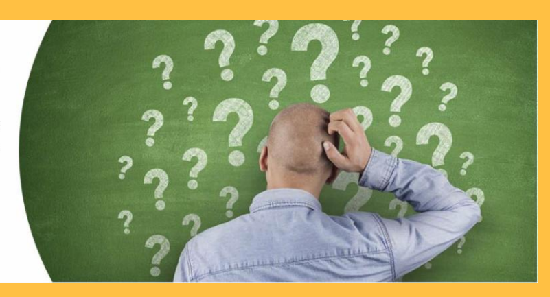
Call the Chamber office today and we'll get you connected